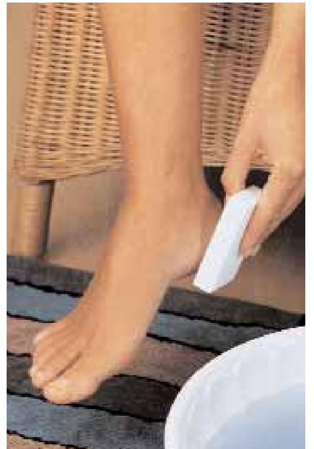
Cautiously remove the excessive callus before applying cream – this allows for better absorption of nutrients into the skin.

Regular care with a cream which supplies moisture and contains fats can prevent or reduce hyperkeratosis.