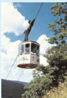
Der Gipfel des Burgbergs ist auch mit der Seilbahn zu erreichen

Wer den Kurort aktiv entdecken möchte, der kann die bezaubernde Natur auf verschiedenen Wanderwegen erkunden. Ausgangspunkt für viele Wanderungen ist der Burgberg, auf dessen Gipfel Sie mit der Seilbahn in drei Minuten gelangen. Für Anfänger oder Ungewübte eignet sich der „Besinnungsweg“. Auf der rund 1,8 km langen Strecke mit leichten Steigungen finden Sie acht Verweilplätze, die zu einer gemütlichen Rast einladen. Bei erfahrenen und geübten Wanderern beliebt ist der Bad Harzburger Teufelsstieg. Dieser Wanderweg erstreckt sich auf 13 km und ist deshalb „teuf-