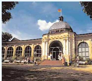
Das Herzstück Bad Harzburgs: die Trink- und Wandelhalle